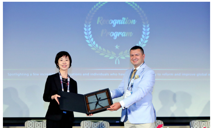
She was awarded for the leadership to revolutionize education in 2023