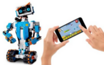
Trainer of Robot School