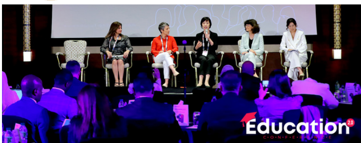
Speaker and contents advisor of educational conference